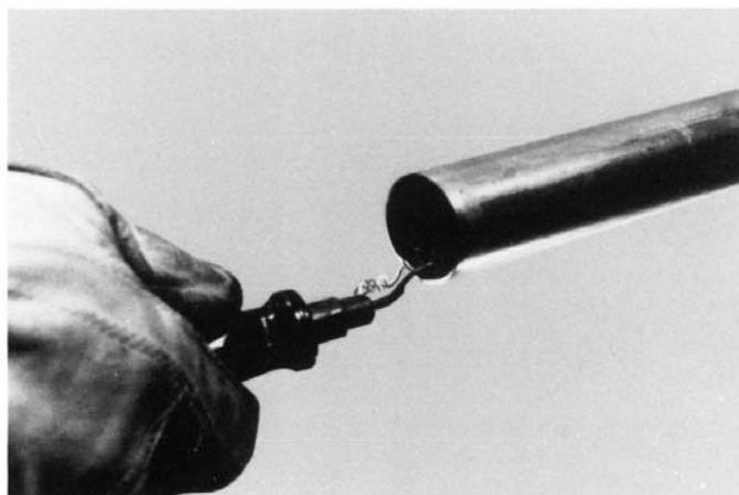
FIG. 5 Reaming: Deburring Tool