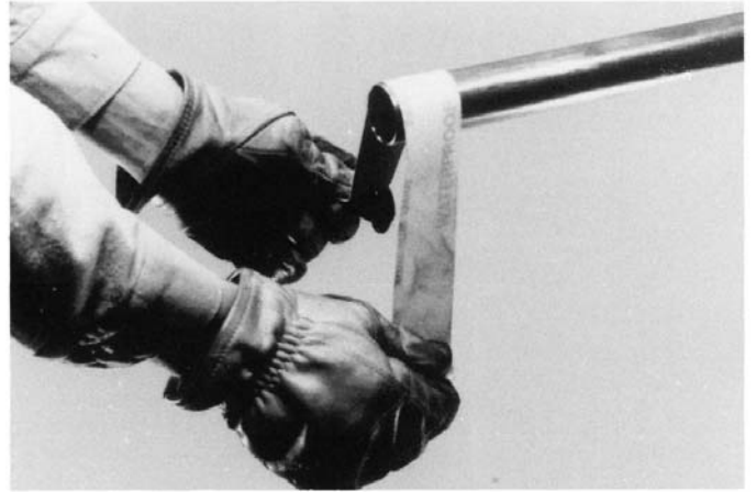
FIG. 6 Cleaning: Sand Cloth