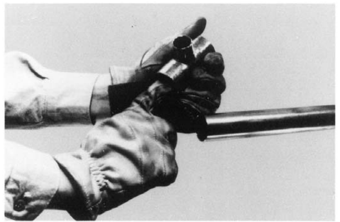
FIG. 8 Cleaning: Abrasive Pad

oxides, surface soil, and oils will interfere with capillary action, lessen the strength of the joint, and cause failure.