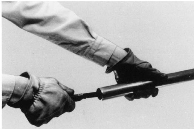
FIG. 4 Reaming: Pocket Knife