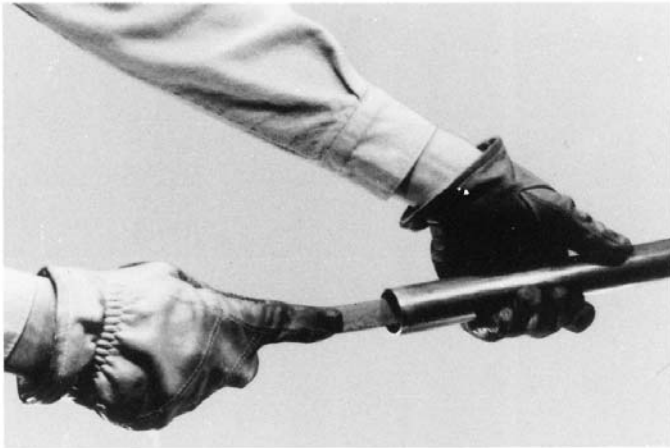
FIG. 3 Reaming: File