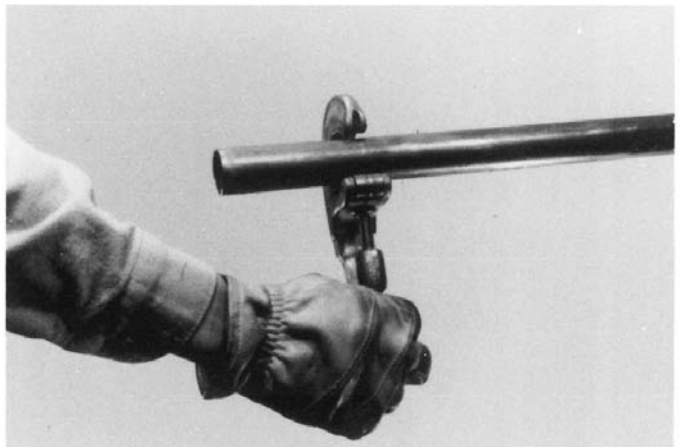
FIG. 2 Cutting

6.2.1 Ream all cut tube ends to the full inside diameter of the tube to remove the small burr created by the cutting operation. Failure to remove this rough edge by reaming is a leading cause of erosion-corrosion that occurs as a result of local turbulence and increased local flow velocity in the tube. A properly reamed piece of tube provides a smooth surface for better flow.